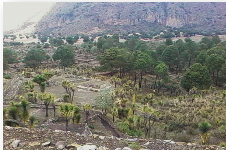
Cantona archeological site, built on and with volcanic rock (day 5).