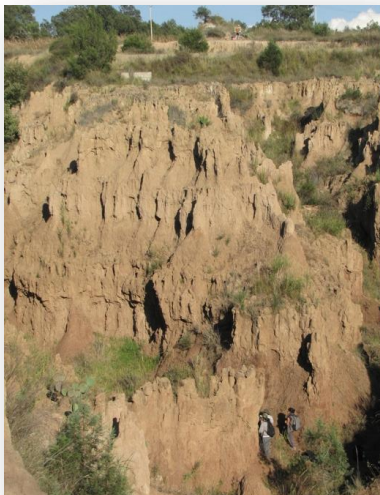
Tlaxcala paleosol sequence, covering a time span of 900 ka (day 4).

Day 5 (Dec 10): Visit of the Cantona archeological site. Along the road, soils and paleosols developed on volcanic materials of different ages will be shown. Arrival in Naolinco, Veracruz. Fieldtrip leaders: Dr. Sergey Sedov, Dr. Elizabeth Solleiro. Stay overnight in Naolinco.