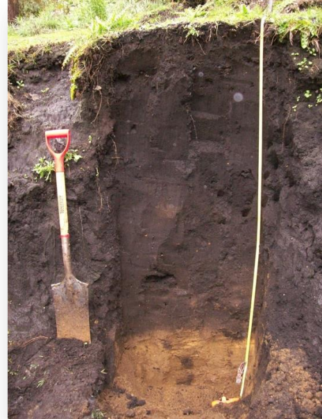
Overview of the Chichinautzin volcanic field (above) and soil profile on pyroclastic material (right) - day 2.

Day 3 (Dec 8): Presentations at the Institute of Geology, UNAM, Mexico City. Stay overnight in Mexico City.