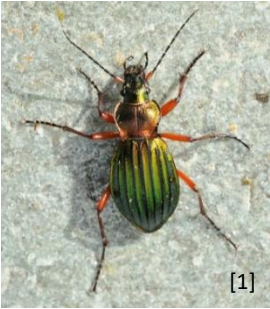
Figure 1: Ground beetle ( Carabus auronitens )

Semi-natural habitats in agricultural landscapes, such as flower fields, can support populations of ecosystem service providers. This includes beneficial agents, such as pest predators, which carry out valuable ecosystem services (e.g. biological pest control).