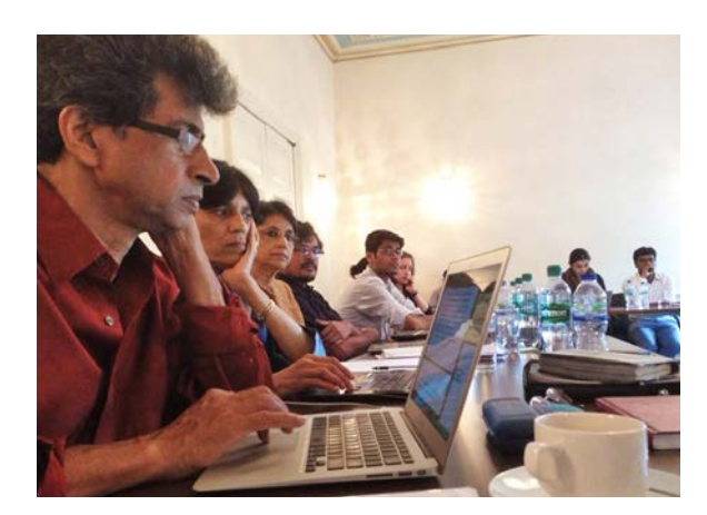
3rd TRG Workshop, GHI London, 7-9 July 2014